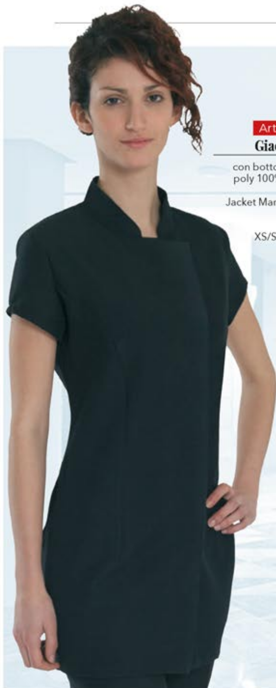
Art. 0984389 Giacca Marika

con bottoni automatici poly 100% - 160 gr/mq nero Jacket Marika automatic buttons black XS/S/M/L/XL/XXL