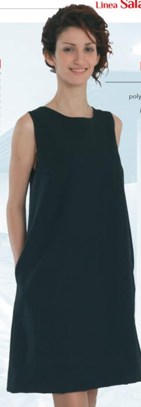
Art. 0982389 Abito Zama

monopetto 3 bottoni poly 100% - 160 gr/mq nero Jacket Barby 1 breast 3 buttons black XS/S/M/L/XL/XXL