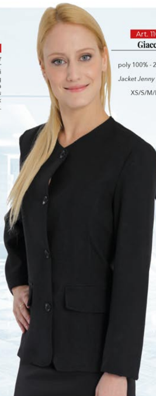
Art. 1104389 Giacca Jenny

3 bottoni poly 100% - 200 gr/mq nera Jacket Shirley 3 buttons black XS/S/M/L/XL/XXL