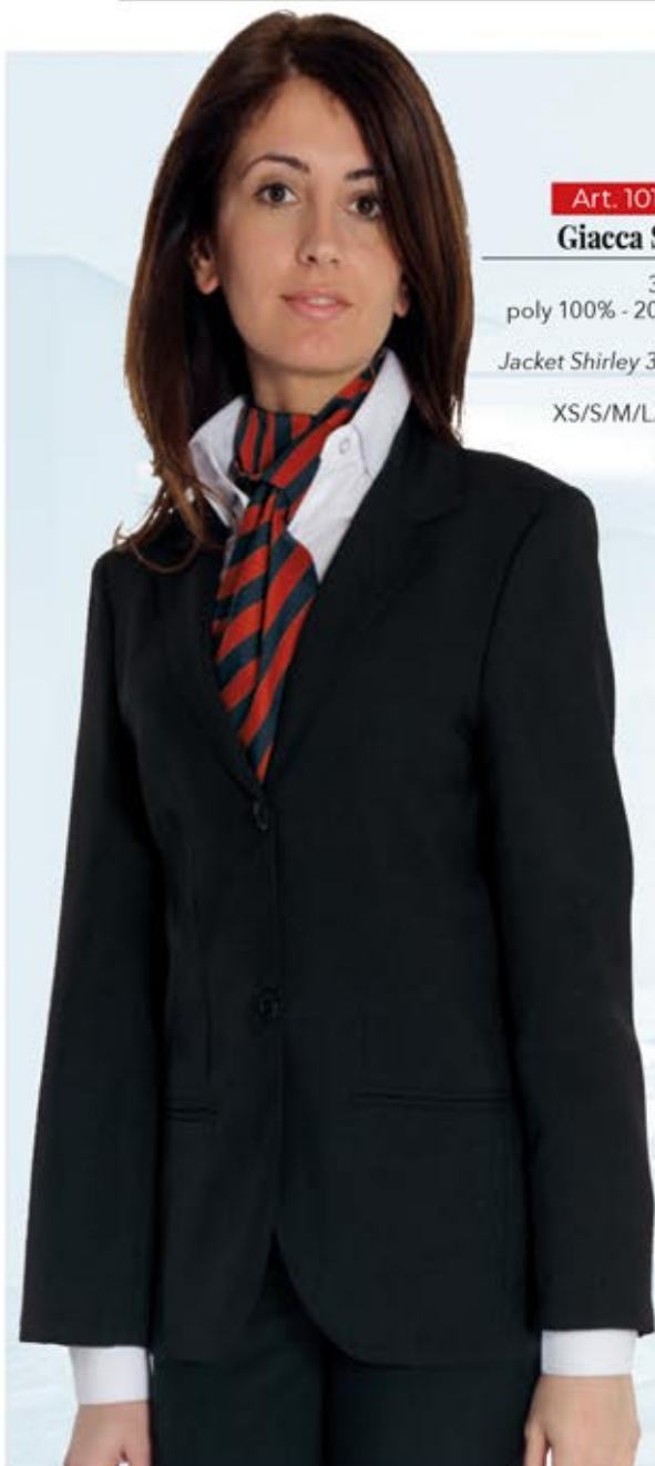
Art. 1016389 Giacca Shirley

3 bottoni poly 100% - 200 gr/mq nera Jacket Shirley 3 buttons black XS/S/M/L/XL/XXL