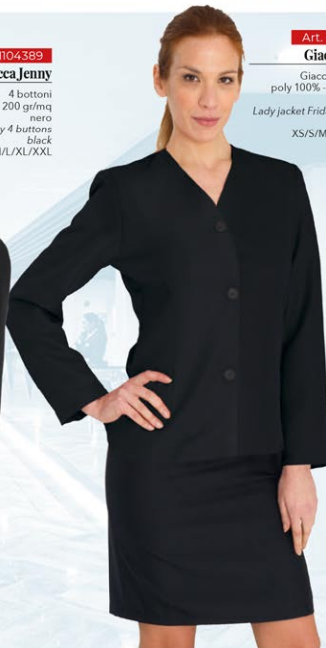
Art. 1101389 Giacca Frida

4 bottoni poly 100% - 200 gr/mq nero Jacket Jenny 4 buttons black XS/S/M/L/XL/XXL